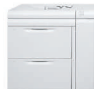
2-Tray Oversized High-Capacity Feeder* 2,000 sheets each tray (4,000 sheets total): Up to 13 x 19.2 in.