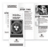
Bi-Folding, C-Folding, Z-Folding