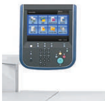
Integrated Copy/Print Server