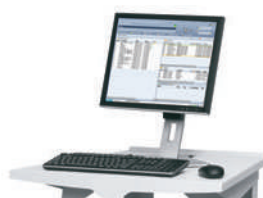
Xerox® FreeFlow Print Server