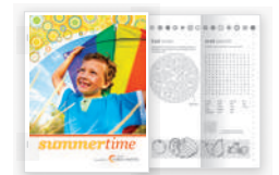
Color Inserts, Stapling and Engineering Z-Folding