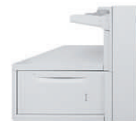
Oversized High-Capacity Feeder 2,000 sheets: Up to 13 x 19.2 in.