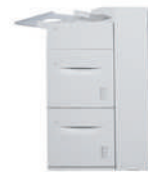
2-Tray High-Capacity Feeder 2,000 sheets each tray (4,000 sheets total): Letter-size