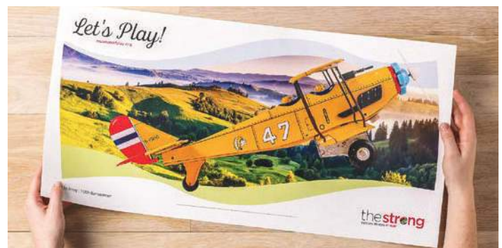
Extra-long sheet printing—maximum paper size 13 x 26" (330 x 660 mm)

It all adds up to better margins, higher profits and the ability to grow strategically with a single, future-proof investment.